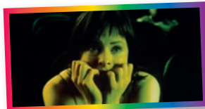
5 She's _____. [cadres]