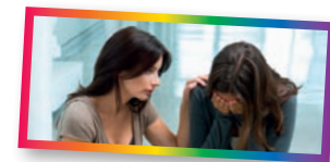
7 She's _____. [sutpe]