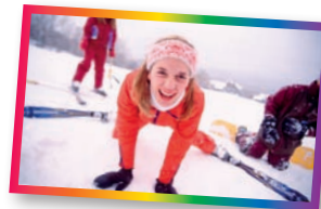
2 She's _____. [drasmebaser]