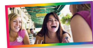
11 They're _____. [ayphp]

2 Completa las frases con palabras del ejercicio 1.