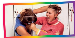
9 They're _____. [yarng]