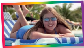
She's relaxed . [ladexre]

1 Ordena las letras y escribe las palabras que describen sentimientos.