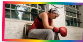
6 She's _____. [idret]