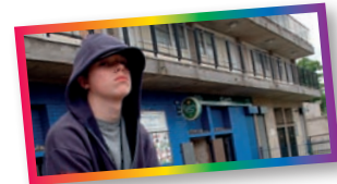
3 He's _____. [deorb]