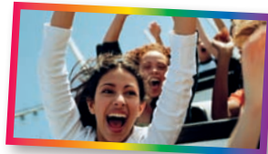
1 They're _____. [deitcex]