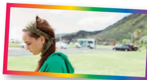
10 She's _____. [oylne]